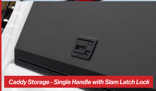
Caddy Storage - Single Handle with Slam Latch Lock