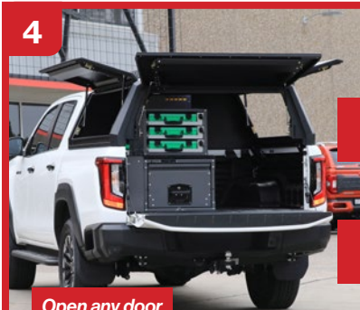
Open any door