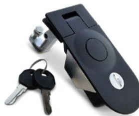
Competitors - Manual Locking