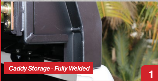
Caddy Storage - Fully Welded