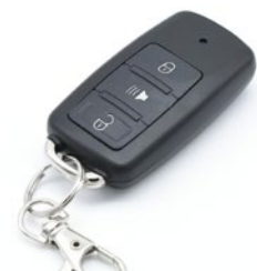
Caddy Storage - Remote Central Locking