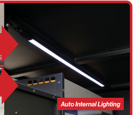
Auto Internal Lighting