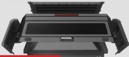
Competitors - Flat Pack