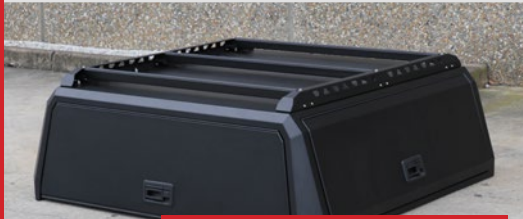
Caddy Storage - Solid Construction