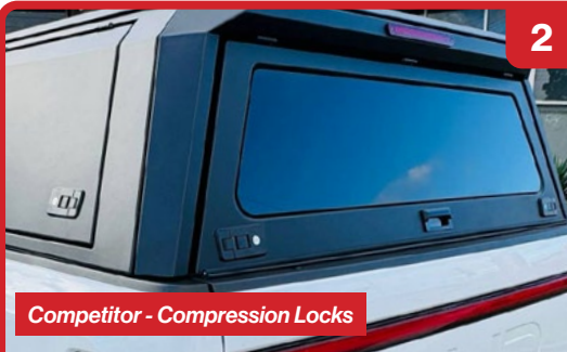
Competitor - Compression Locks