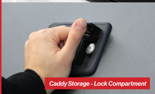
Caddy Storage - Lock Compartment