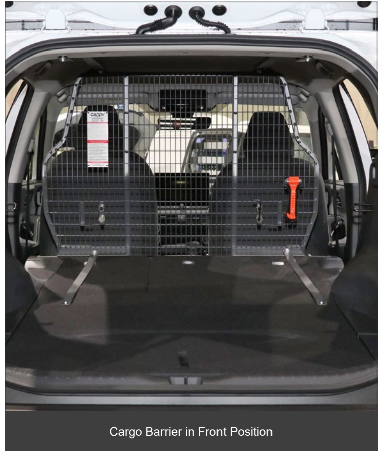
Cargo Barrier in Front Position