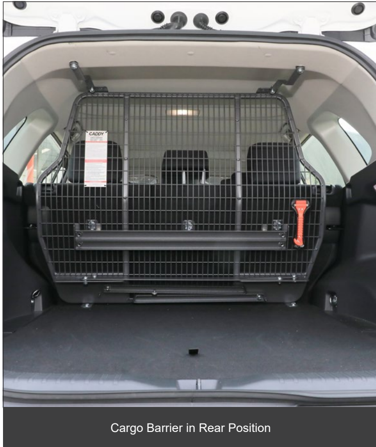
Cargo Barrier in Rear Position