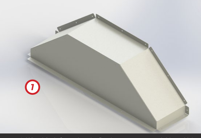
1. Wheel Arch Cover (can be fitted on passenger and driver side)