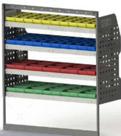
PASSENGER SIDE REAR

Unit Size: 1080mm w x 1220mm h End panels: Standard Panel Left, Special Right No. of shelves: 4 Shelf Depth: 310mm (Row 1), 410mm (Rows 2 & 4), 350mm (Row 3) Plastic Bins: 10 x PBC 3.0, 10 x PBC 4.0, 5 x PBC 6.0, 5 x PBC 8.0