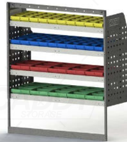
DRIVER SIDE REAR

Unit Size: 1080mm w x 1220mm h End panels: Standard Panel Right, Special Left No. of shelves: 4 Shelf Depth: 310mm (Row 1), 410mm (Rows 2 & 4), 350mm (Row 3) Plastic Bins: 10 x PBC 3.0, 10 x PBC 4.0, 5 x PBC 6.0, 5 x PBC 8.0