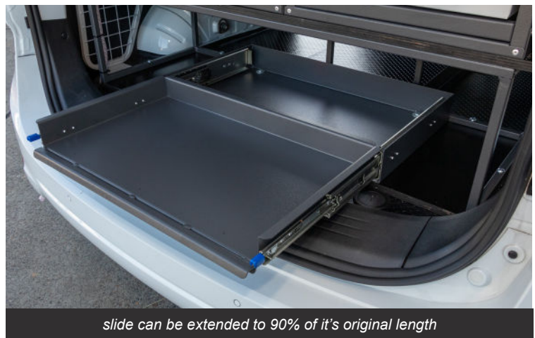
slide can be extended to 90% of it's original length