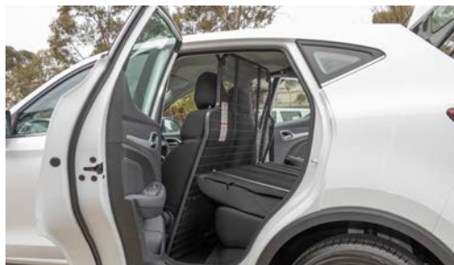
2nd Row of Seating Folded down