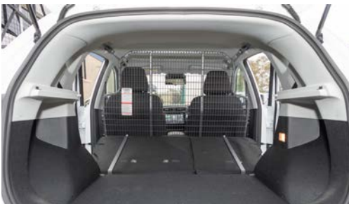
Cargo Barrier Installed behind 1st Row of Seating