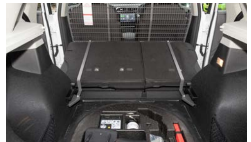
Allows accessibility to Spare Wheel