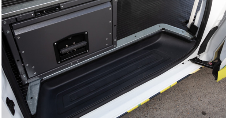
Flooring Side Door Metal Trims