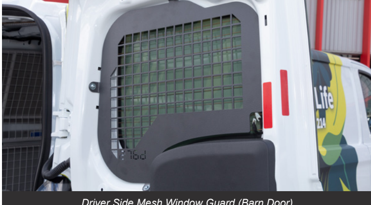
Driver Side Mesh Window Guard (Barn Door)