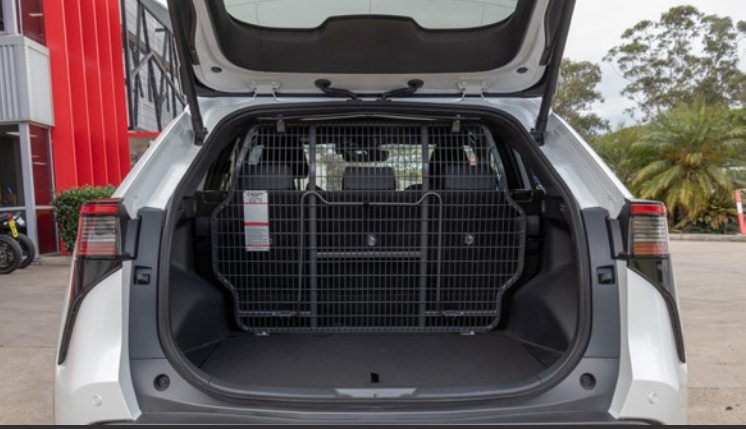
Cargo Barrier in Rear Position (behind 2nd row seats)