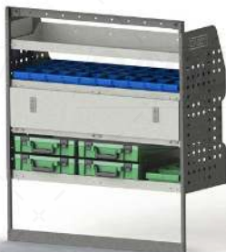
PASSENGER SIDE REAR

Unit Size: 1080mm w x 1220mm h End panels: Standard Panel Left, Special Right No. of shelves: 4 + (1 x DOR-06, 2 x CCA-2) Shelf Depth: 310mm (Row 1), 410mm (Rows 2 & 4), 350mm (Row 3) Plastic Bins: 10 x PBC 4.0, 1 x PBC 8.0