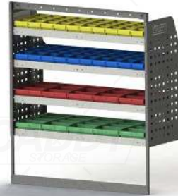
DRIVER SIDE REAR

Unit Size: 1080mm w x 1220mm h End panels: Standard Panel Right, Special Left No. of shelves: 4 Shelf Depth: 310mm (Row 1), 410mm (Rows 2 & 4), 350mm (Row 3) Plastic Bins: 10 x PBC 3.0, 10 x PBC 4.0, 5 x PBC 6.0, 5 x PBC 8.0