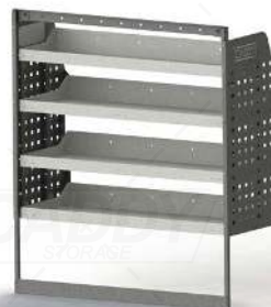
DRIVER SIDE REAR