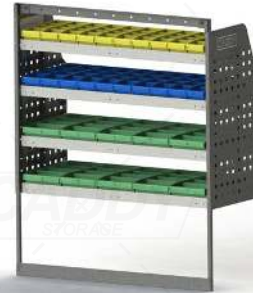
DRIVER SIDE REAR

Unit Size: 1080mm w x 1290mm h End panels: Standard Panels No. of shelves: 4 Shelf Depth: 310mm (Row 1), 410mm (Rows 2-4) Plastic Bins: 10 x PBC 3.0, 10 x PBC 4.0, 10 x PBC 8.0