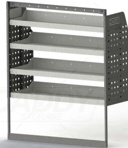
DRIVER SIDE REAR

Unit Size: 1080mm w x 1290mm h End panels: Standard Panels No. of shelves: 4 Shelf Depth: 310mm (Row 1), 410mm (Rows 2-4) Plastic Bins: None