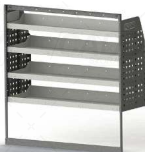
PASSENGER SIDE REAR

Unit Size: 1260mm w x 1290mm h End panels: Standard Panels No. of shelves: 4 Shelf Depth: 310mm (Row 1), 410mm (Rows 2-4) Plastic Bins: 12 x PBC 3.0, 12 x PBC 4.0, 12 x PBC 8.0