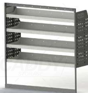
DRIVER SIDE REAR

Unit Size: 1260mm w x 1290mm h End panels: Standard Panels No. of shelves: 4 Shelf Depth: 310mm (Row 1), 410mm (Rows 2-4) Plastic Bins: 12 x PBC 3.0, 12 x PBC 4.0, 12 x PBC 8.0