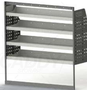
DRIVER SIDE REAR

Unit Size: 1260mm w x 1290mm h End panels: Standard Panels No. of shelves: 4 Shelf Depth: 310mm (Row 1), 410mm (Rows 2-4) Plastic Bins: None