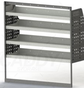
DRIVER SIDE REAR

Note: Requires Driver side Front Mounting Bracket (ADJ-FTC24-SMK-007)