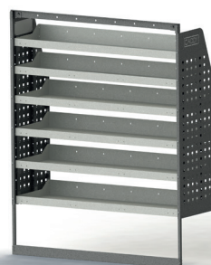
DRIVER SIDE REAR