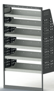
DRIVER SIDE MID