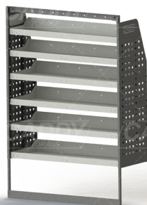
DRIVER SIDE MID