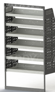
DRIVER SIDE REAR