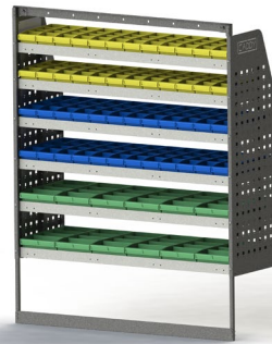
DRIVER SIDE REAR

Plastic Bins: 24 x PBC 3.0, 24 x PBC 4.0, 12 x PBC 8.0