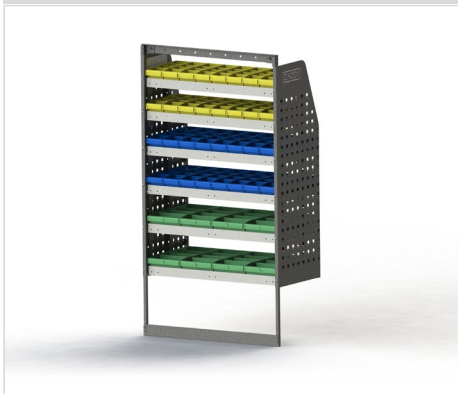
DRIVER SIDE MID

Plastic Bins: 24 x PBC 3.0, 24 x PBC 4.0, 12 x PBC 8.0