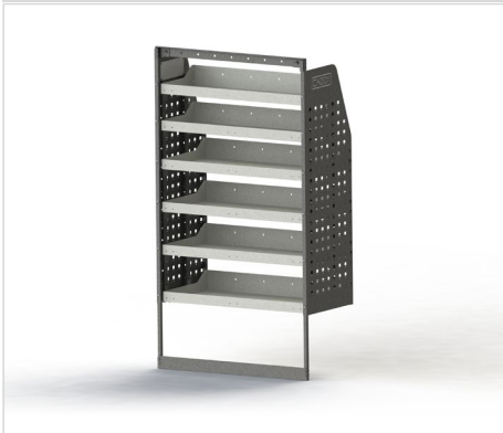
DRIVER SIDE MID