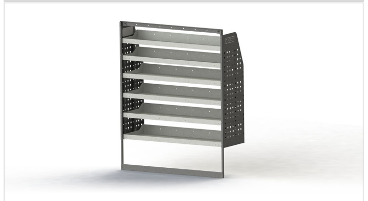
DRIVER SIDE REAR