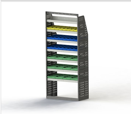
DRIVER SIDE MID

Plastic Bins: 8 x PBC 3.0 , 16 x PBC 4.0, 12 x PBC 8.0