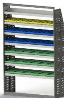
PASSENGER SIDE REAR

K15-1260 (with Plastic Bins) Unit Size: 1260mm w x 1950mm h End panels: Full Panels No. of shelves: 7 Shelf Depth: 240mm (Row 1), 310mm (Row 2), 410mm (Rows 3-7) Plastic Bins: 12 x PBC 3.0, 24 x PBC 4.0, 18 x PBC 8.0