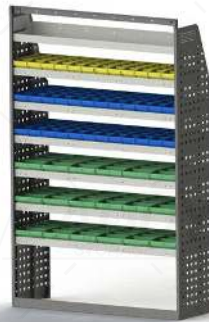
DRIVER SIDE MID

K15-1260 (with Plastic Bins) Unit Size: 1260mm w x 1950mm h End panels: Full Panels No. of shelves: 7 Shelf Depth: 240mm (Row 1), 310mm (Row 2), 410mm (Rows 3-7) Plastic Bins: 12 x PBC 3.0, 24 x PBC 4.0, 18 x PBC 8.0