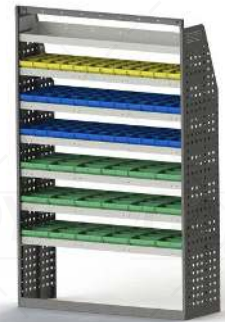
DRIVER SIDE REAR

K15-1260 (with Plastic Bins) Unit Size: 1260mm w x 1950mm h End panels: Full Panels No. of shelves: 7 Shelf Depth: 240mm (Row 1), 310mm (Row 2), 410mm (Rows 3-7) Plastic Bins: 12 x PBC 3.0, 24 x PBC 4.0, 18 x PBC 8.0