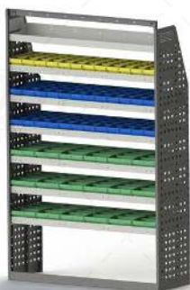
PASSENGER SIDE FRONT

K15-1260 (with Plastic Bins) Unit Size: 1260mm w x 1950mm h End panels: Full Panels No. of shelves: 7 Shelf Depth: 240mm (Row 1), 310mm (Row 2), 410mm (Rows 3-7) Plastic Bins: 12 x PBC 3.0, 24 x PBC 4.0, 18 x PBC 8.0