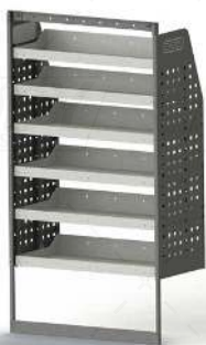
PASSENGER SIDE FRONT

Unit Size: 850mm w x 1570mm h End panels: Standard Panels No. of shelves: 6 Shelf Depth: 310mm (Rows 1 - 2), 410mm (Rows 3 - 6) Plastic Bins: None