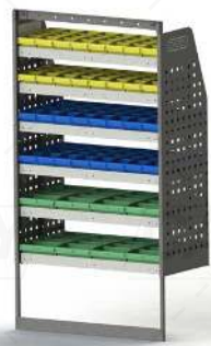
DRIVER SIDE REAR

Unit Size: 850mm w x 1570mm h End panels: Standard Panels No. of shelves: 6 Shelf Depth: 310mm (Rows 1 - 2), 410mm (Rows 3 - 6) Plastic Bins: 16 x PBC 3.0, 16 x PBC 4.0, 8 x PBC 8.0