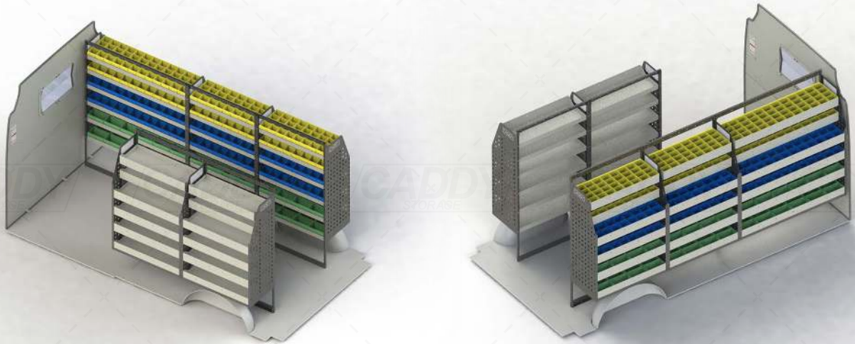
DRIVER SIDE FRONT