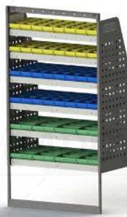
DRIVER SIDE MID

Plastic Bins: 24 x PBC 3.0, 24 x PBC 4.0, 12 x PBC 8.0