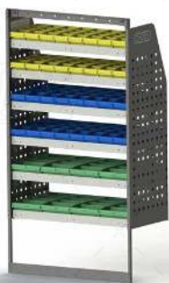
PASSENGER SIDE FRONT

Plastic Bins: 16 x PBC 3.0, 16 x PBC 4.0, 8 x PBC 8.0