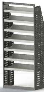
DRIVER SIDE MID

Unit Size: 850mm w x 1950mm h End panels: Full Panels No. of shelves: 7 Shelf Depth: 240mm (Row 1), 310mm (Row 2), 410mm (Rows 3-7) Plastic Bins: None