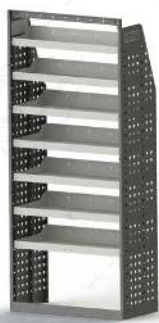
PASSENGER SIDE FRONT

Unit Size: 850mm w x 1950mm h End panels: Full Panels No. of shelves: 7 Shelf Depth: 240mm (Row 1), 310mm (Row 2), 410mm (Rows 3-7) Plastic Bins: None