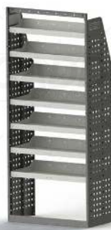
PASSENGER SIDE REAR

Unit Size: 850mm w x 1950mm h End panels: Full Panels No. of shelves: 7 Shelf Depth: 240mm (Row 1), 310mm (Row 2), 410mm (Rows 3-7) Plastic Bins: None