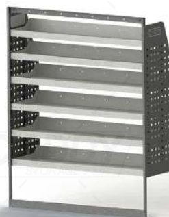
DRIVER SIDE REAR