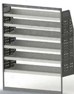
PASSENGER SIDE REAR