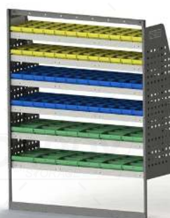
DRIVER SIDE REAR