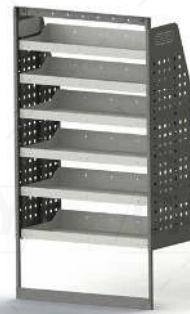
DRIVER SIDE REAR

Unit Size: 850mm w x 1570mm h End panels: Standard Panels No. of shelves: 6 Shelf Depth: 310mm (Rows 1 - 2), 410mm (Rows 3 - 6) Plastic Bins: None