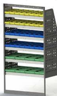
PASSENGER SIDE FRONT

Plastic Bins: 16 x PBC 3.0, 16 x PBC 4.0, 8 x PBC 8.0