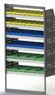
DRIVER SIDE REAR

Plastic Bins: 16 x PBC 3.0, 16 x PBC 4.0, 8 x PBC 8.0