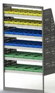
PASSENGER SIDE REAR

Plastic Bins: 16 x PBC 3.0, 16 x PBC 4.0, 8 x PBC 8.0