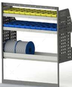
PASSENGER SIDE REAR

Unit Size: 1080mm w x 1290mm h End panels: Standard Left, Special Right No. of shelves: 3 (1 x Cable Shelf, 1 x Bottom Bar) Shelf Depth: 310mm (Row 1), 410mm (Rows 2-4) Plastic Bins: 10 x PBC 3.0, 10 x PBC 4.0