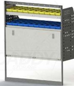
DRIVER SIDE REAR

Unit Size: 1080mm w x 1290mm h End panels: Standard Panel Right, Special Left No. of shelves: 4 + (1X DOR-26) Shelf Depth: 310mm (Row 1), 410mm (Row 2), 350mm (Rows 3-4) Plastic Bins: 10 x PBC 3.0, 10 x PBC 4.0