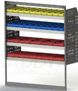
DRIVER SIDE REAR

Plastic Bins: 8 x PBC 3.0, 8 x PBC 4.0, 8 x PBC 8.0